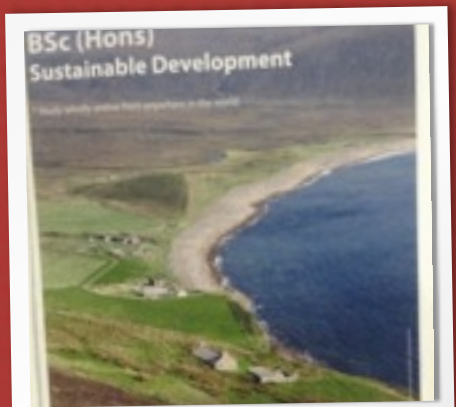
WIND AND WAVE ENERGY ARE PREVALENT ON THE SCOTTISH ISLES