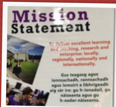
LEWS CASTLE COLLEGE MISSION STATEMENT IN ENGLISH AND GAELIC